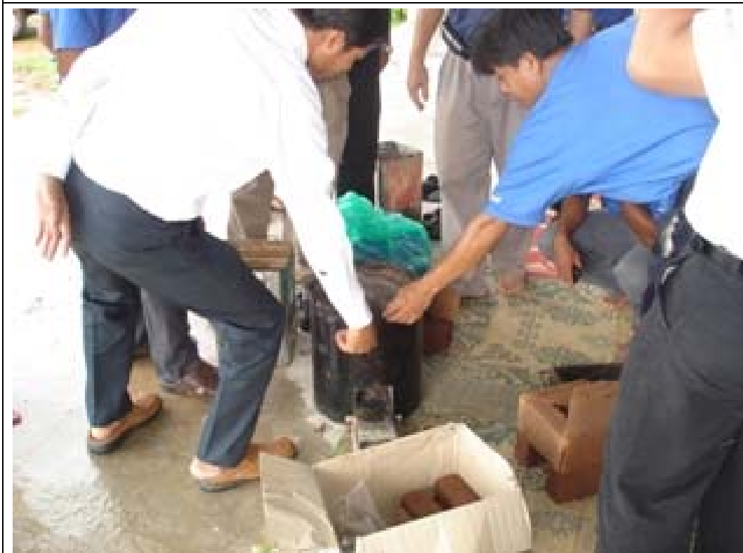
Figure 4: Participants doing exercise on rocket stove