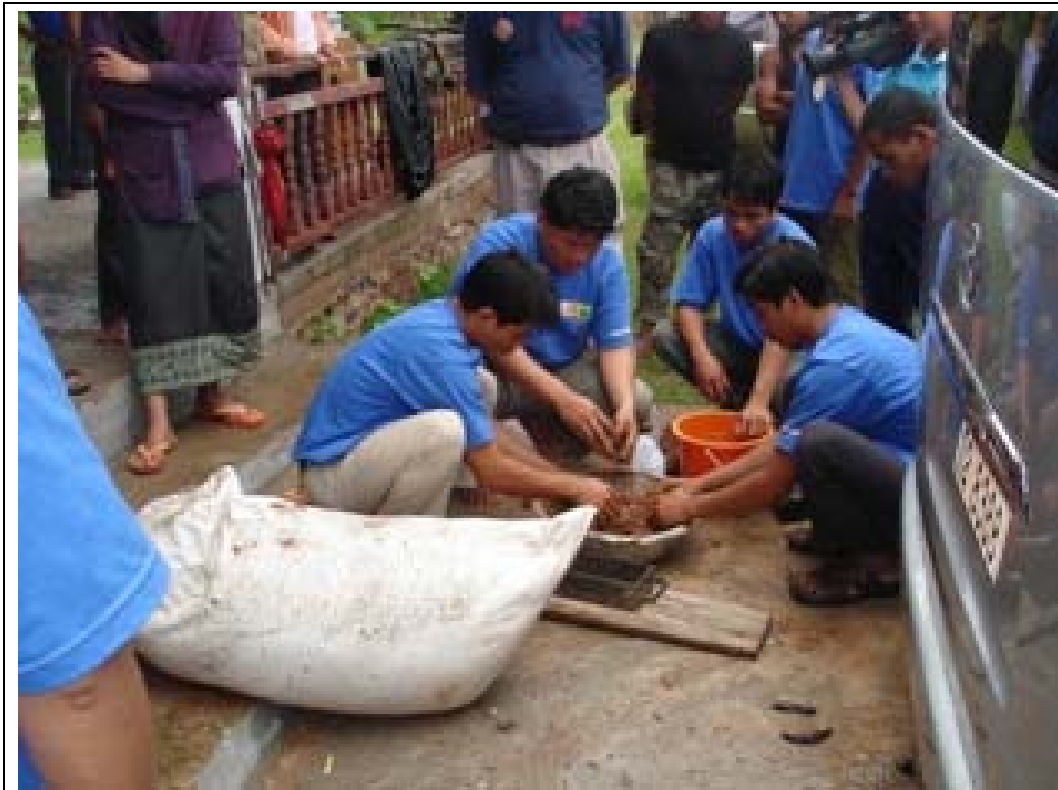
Figure 3: Participants doing exercise on rocket stove