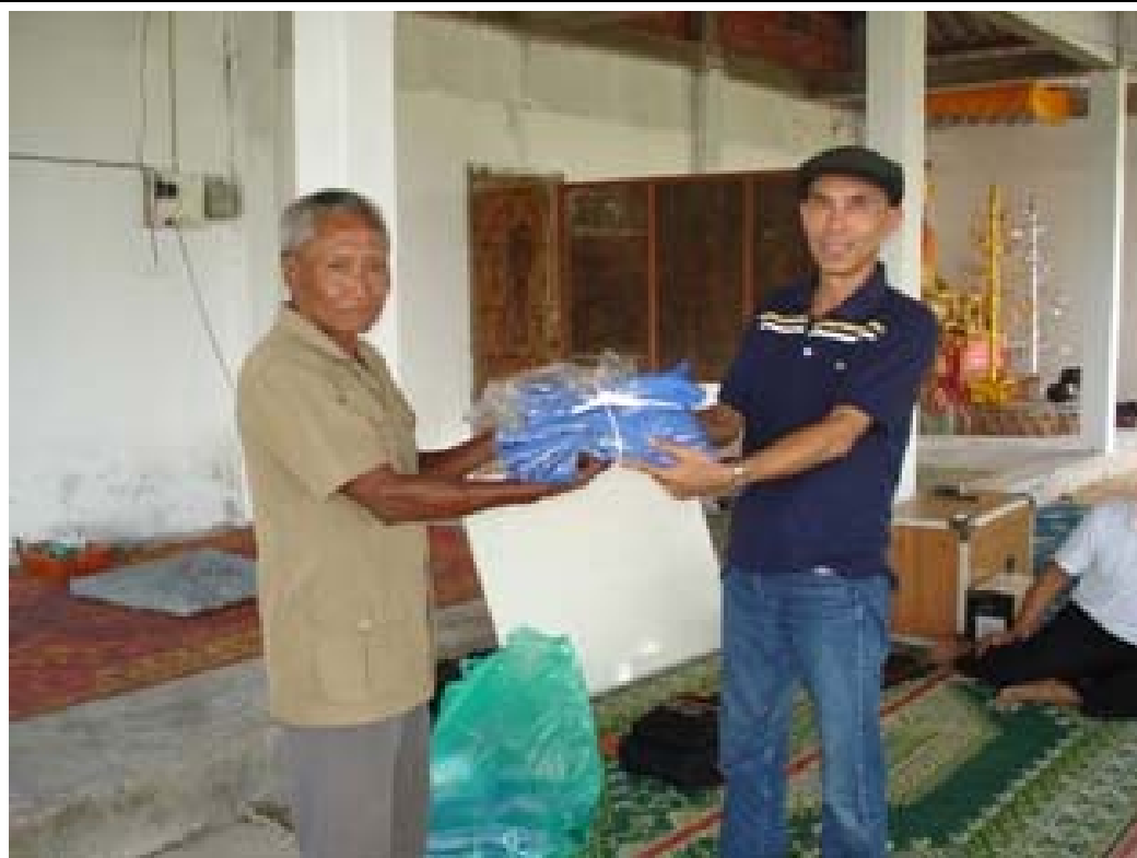
Figure 5: REEPRO project had distributed T- Shirts for participants